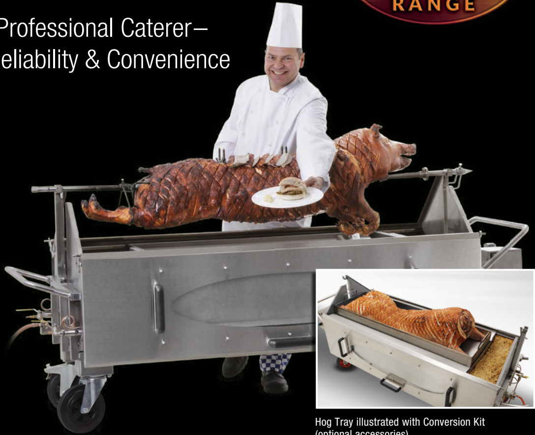
Hog Tray illustrated with Conversion Kit (optional accessories)