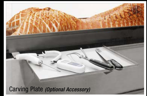
Carving Plate (Optional Accessory)